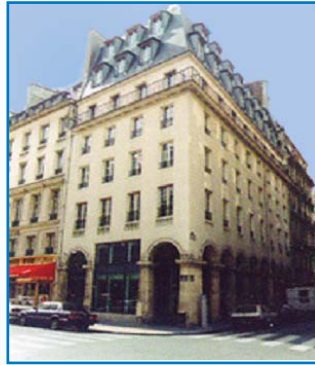
Paris, France Questel Headquarters

Alexandra House - The Sweepstakes Ballsbridge - Dublin 4 Phone: +353 (0) 163 19 000 Fax: +353 (0) 163 19 001 company@designmuster.com