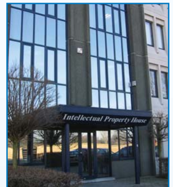
Brussels, Belgium R&D, Trademarks