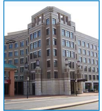
Alexandria, VA US Headquarters